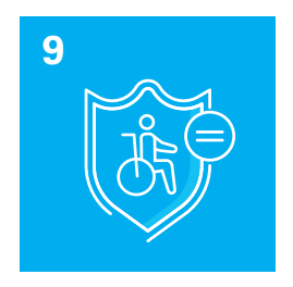
Ensure equal access for marginalized populations