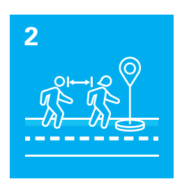
Ensure physical distancing during school drop-off and pick-up