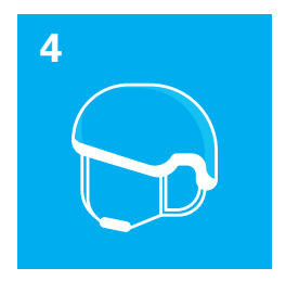
Make it safe to walk, cycle, scoot and ride a wheelchair