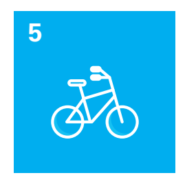
Help students who cycle and scoot to follow protocols