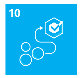
Sustain changes in the long term